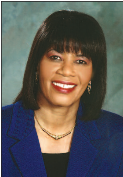
The Most Honourable Portia Simpson Miller, ON, MP Leader of the Opposition

Our beloved National Anthem, itself a prayer for structured guidance to our country's development has enshrined within it the abiding request of our Father to "Give us vision lest we perish".