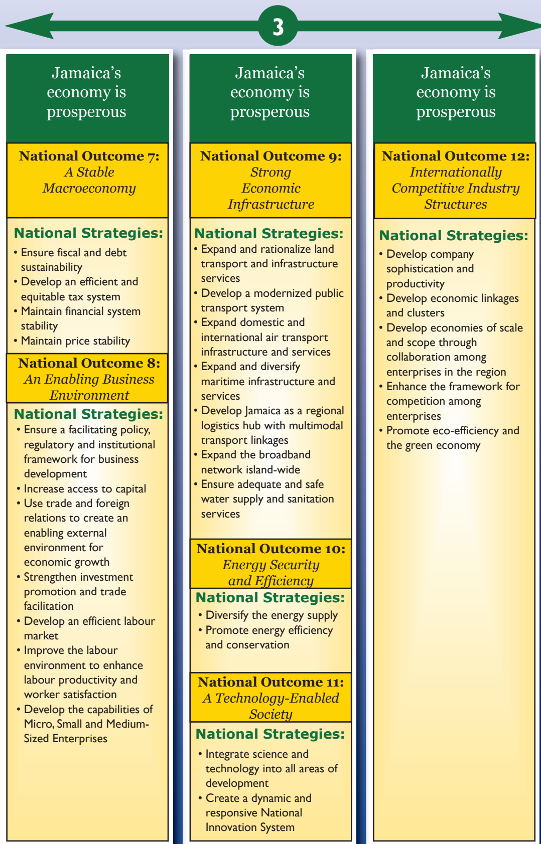
Table 1: National Strategies Linked to Goals and Outcomes (Cont'd)