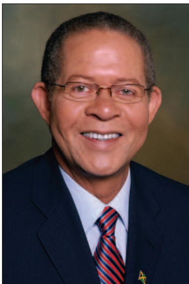
The Honourable Bruce Golding, MP Prime Minister

My fellow Jamaicans, we are now embarking on a path of national transformation through Vision 2030 Jamaica – National Development Plan - a vision of a new society that is inclusive of the dreams and aspirations of all Jamaicans; a society that is secure, humane and just; and a place for which we all take responsibility in owning and protecting for future generations.