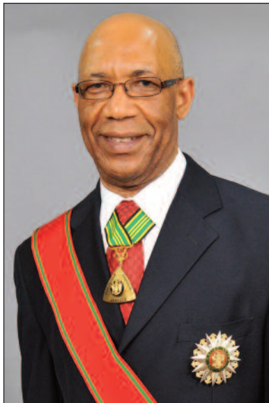
His Excellency, The Most Honourable Patrick L. Allen, ON, CD, PhD Governor General

It is fitting that the Vision 2030 Jamaica - National Development Plan , which is being tabled in Parliament, is the result of widespread consultations with stakeholders across Jamaica, as it embodies the kinds of positive conversations that we must have if we are to express our concerns one to another, define our common goals and identify pathways toward achieving them.