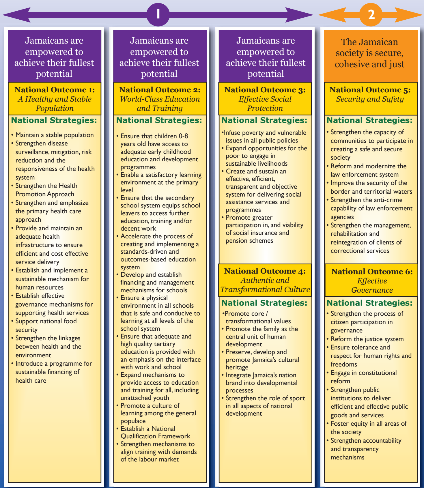
Table 1: National Strategies Linked to Goals and Outcomes